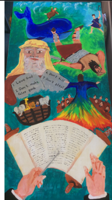
People of God